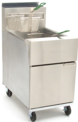
SR62G Shown with optional casters.